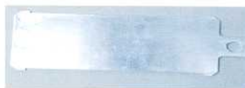
99 Mo target plate

accordance with prescribed specifications of fission 99 Mo for medical applications.