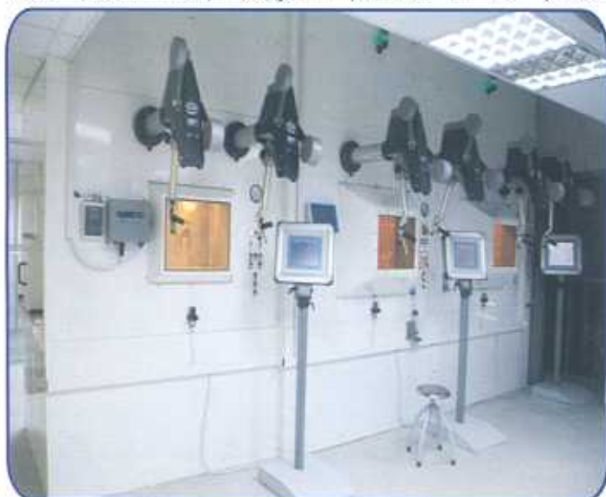
Hot cells with master slave manipulators and control panels of fission ^{99}\text{Mo} facility

Installation work for MPF started in June 2006 and was completed in March 2007. The inactive functionality testing of equipments and tools was performed by PINSTECH prior to radioactive commissioning of the MPF. Radiochemical separation procedure for isolation of fission ^{99}\text{Mo} from neutron irradiated U/Al alloy target was initiated