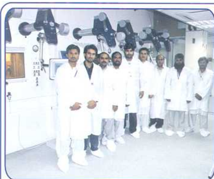
Researcher behind Commissioning of fission 99 Mo facility

in the supervision of German experts which was finally accomplished by PINSTECH researchers in July 2007. During cold commissioning, the in-cell equipment was checked thoroughly and deficiencies were communicated to the supplier. Finally installation work was completed in June 2009 and complete cold run as well as tracer experiments with 131 I and 99 Mo were performed. In December 2009, mCi level radioactive commissioning was performed. Natural U/Al target plates were irradiated for short periods in the core of Pakistan Research Reactor-1 (PARR-1) and 99 Mo was separated from uranium, actinides and other fission products. The final 99 Mo product was of high purity and met all necessary specifications for medical applications.